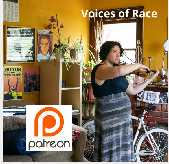
Social Change Photography (ways to engage):